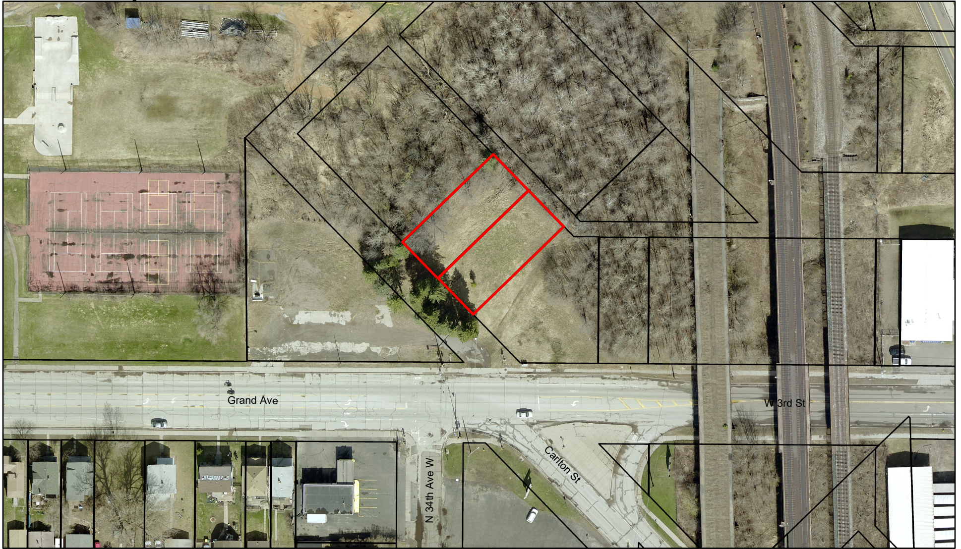
Exhibit A - City Parcels