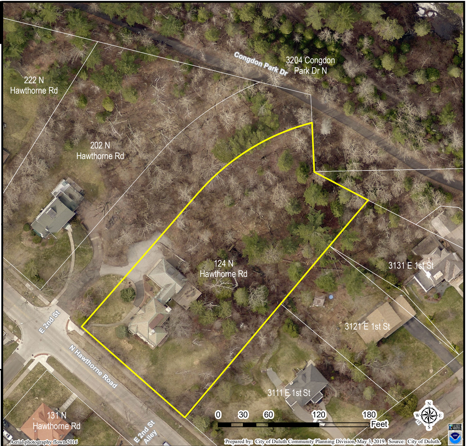
Aerial photography flown 2016

The City of Duluth has tried to ensure that the information contained in this map or electronic document is accurate. The City of Duluth makes no warranty or guarantee concerning the accuracy or reliability. This drawing/data is neither a legally recorded map nor a survey and is not intended to be used as one. The drawing/data is a compilation of records, information and data located in various City, County and State offices and other sources affecting the area shown and is to be used for reference purposes only. The City of Duluth shall not be liable for errors contained within this data provided or for any damages in connection with the use of this information contained within.