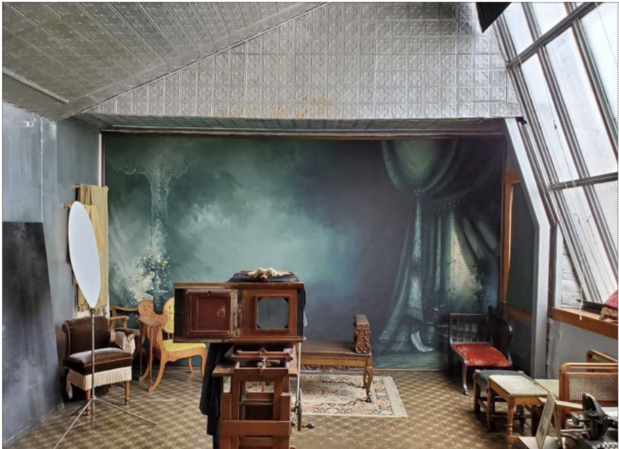
FROM THE CONDITION ASSESSMENT REPORT, GUST AKERLUND PHOTOGRAPHY STUDIO, CITY OF COKATO