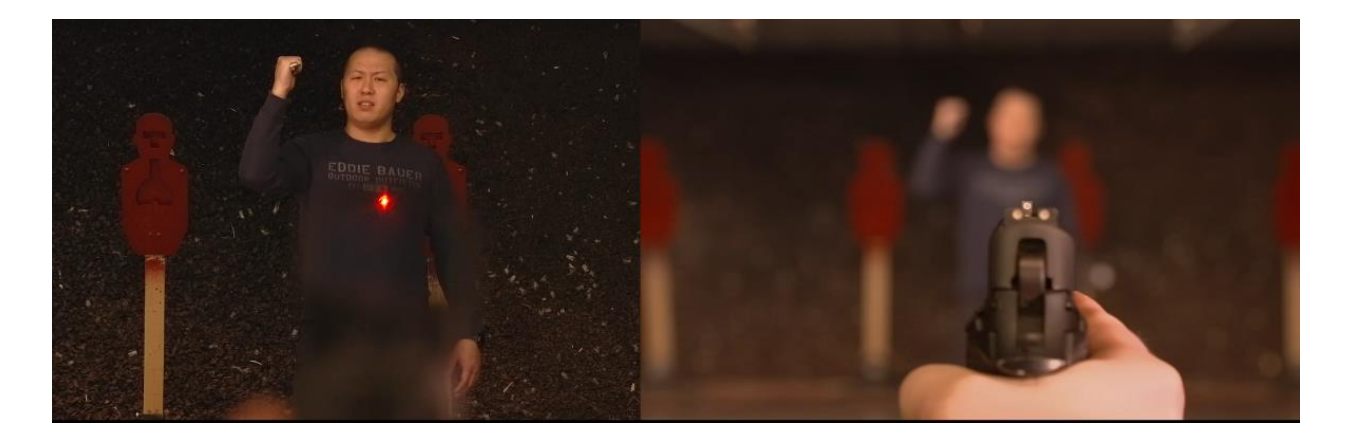
Iron Sights Sight Picture