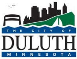
EXHIBIT B Public Administration Department Parks and Recreation Division

City Hall - Ground Floor • 411 West First Street • Duluth, Minnesota • 55802 218-730-4300 • www.duluthmn.gov/parks/index.cfm