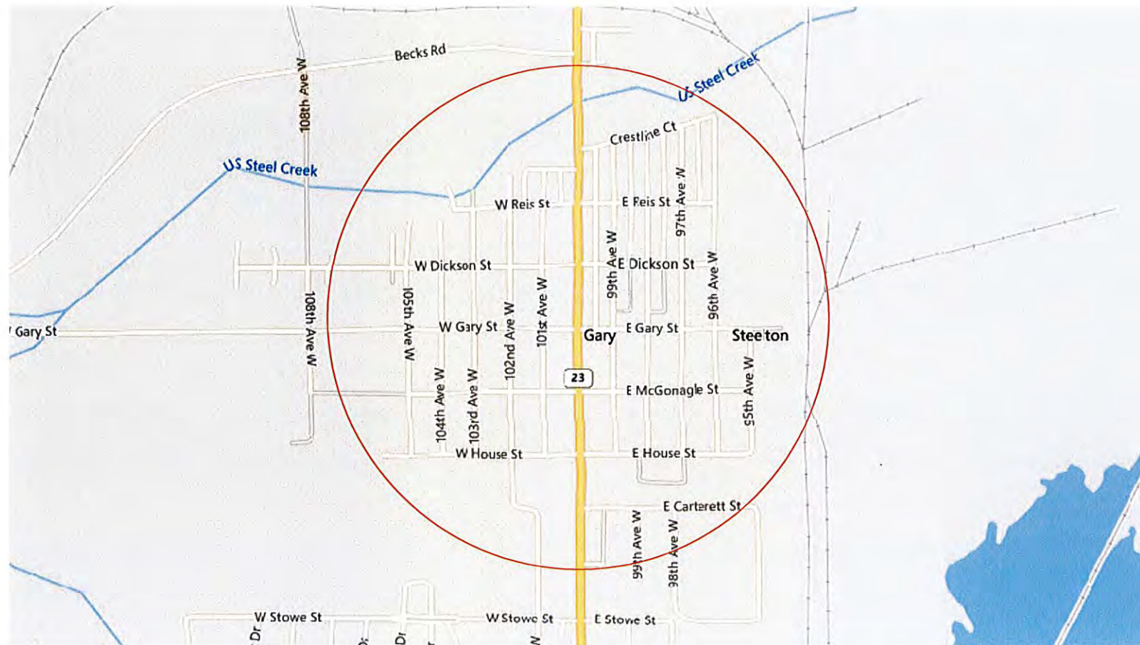
SITE LOCATION MAP NOT TO SCALE

THE SUBSURFACE UTILITY INFORMATION IN THIS PLAN IS UTILITY QUALITY LEVEL D. THIS QUALITY LEVEL WAS DETERMINED ACCORDING TO THE GUIDELINES OF C/ASCE 38-2, ENTITLED "STANDARD GUIDELINES FOR THE COLLECTION AND DEPICTION OF EXISTING SUBSURFACE UTILITY DATA."