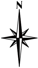
Exhibit for existing "Accessible Parking Plan" in City of Duluth Right of Way along 54th Avenue East adjacent with Lot 18 in Block 11 in the plat of LESTER PARK 2ND DIVISION.