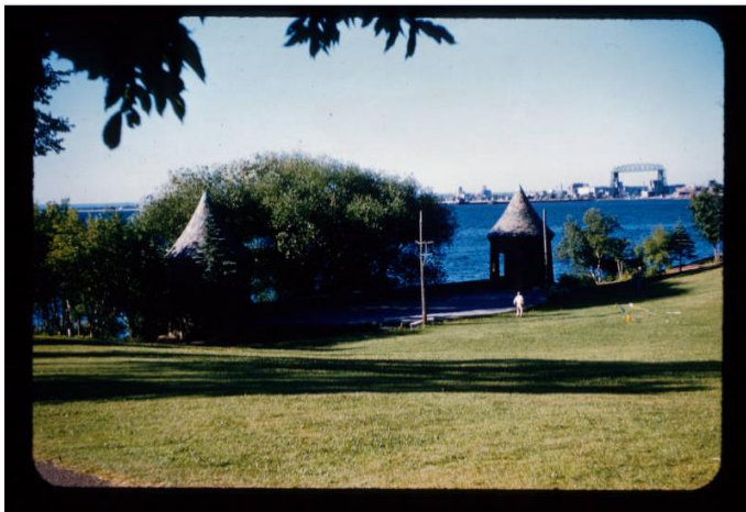
International Folk Festival