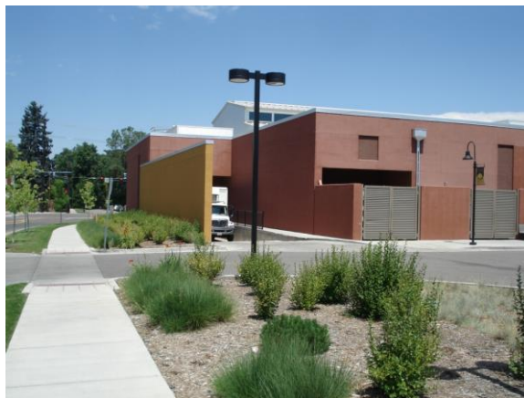
Figure 50-26.2-A: Loading area screening