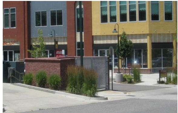
Figure 50-26.3-A: Dumpster screening