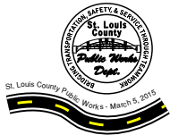
St. Louis County 2016 Road & Bridge Construction

Road Number 9 Project #SP 069-609-040 County Project #147349 Location: 6th Ave. E. to Wallace Avenue Construction Type: Reconstruction