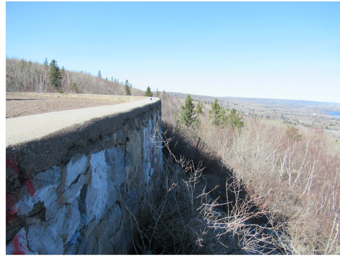
View of Bardon's Peak Scenic Overlook turnout parking area.