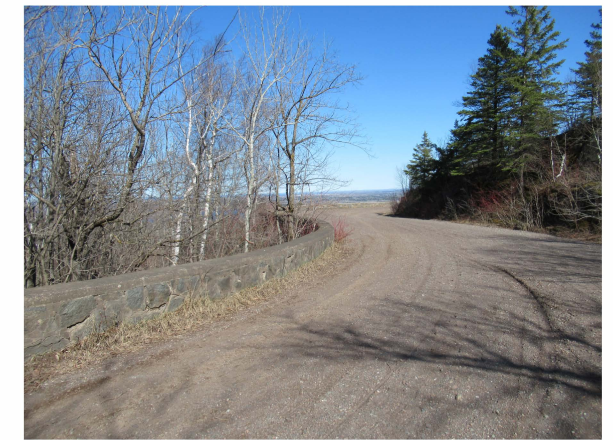
View approaching turnout parking area.