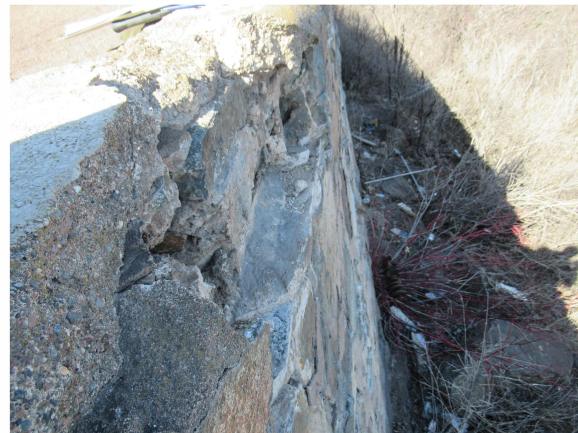
Bardon's Peak Scenic Overlook retaining wall damage.