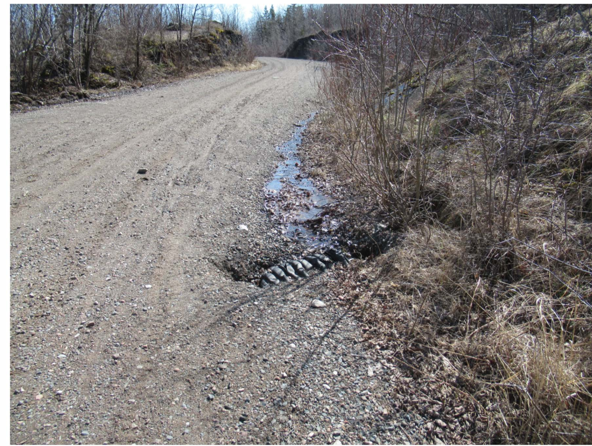
Skyline Parkway Bardon's Peak segment culvert damage - ditching required.