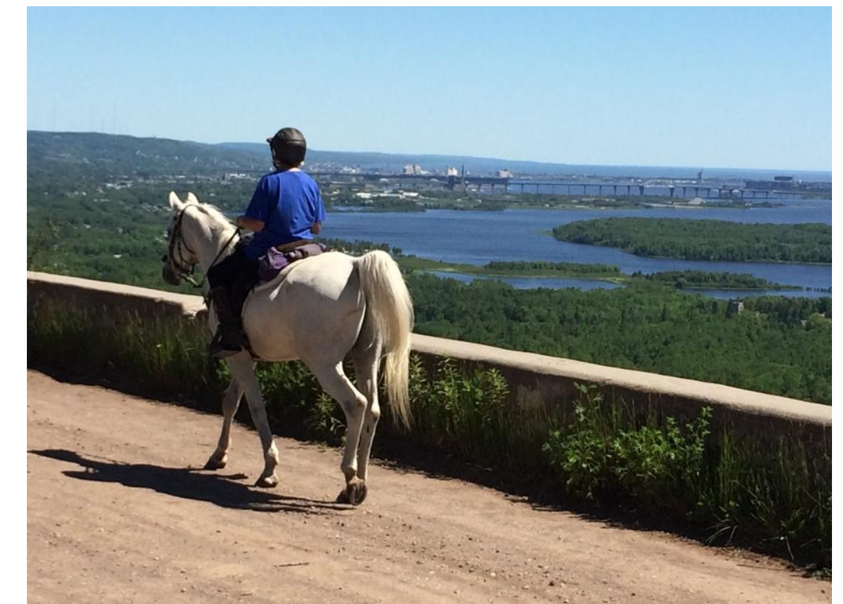
Alternative mode of transportation