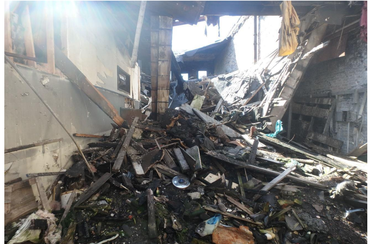
Complete roof collapse and partial collapse of the second floor structure of the 118 East 1 st Street building.