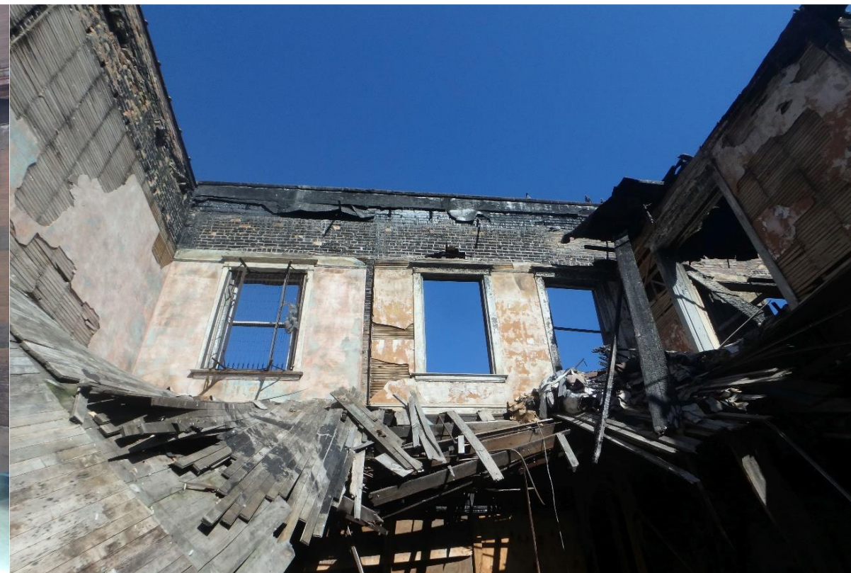
View from the inside of the 118 East 1 st St Street building looking towards 1 st Street. Note roof absence and second floor separation.