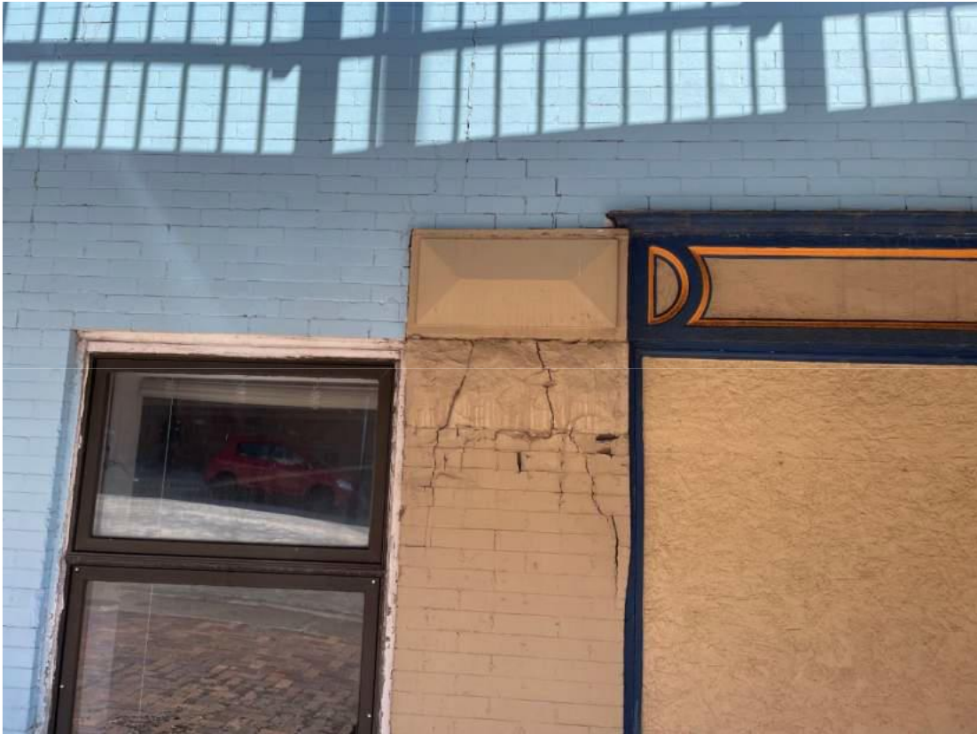
Photo 8: Close-up view of brick condition on west exterior wall looking east