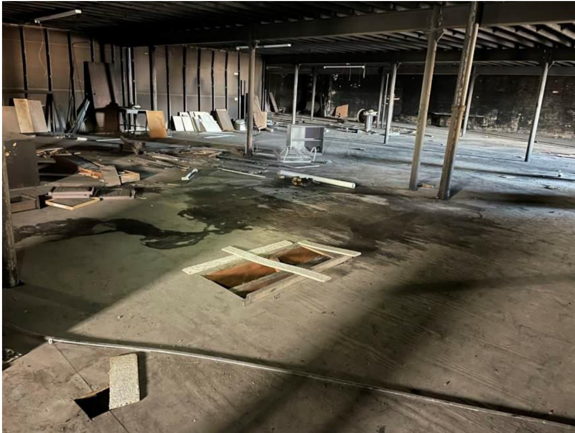
Photo 23: Existing wet flooring on the upper level due to roof leaks.