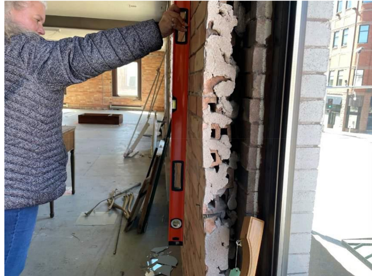
Photo 24: Existing north wall is bowed inward due to poor construction methods and water infiltration.