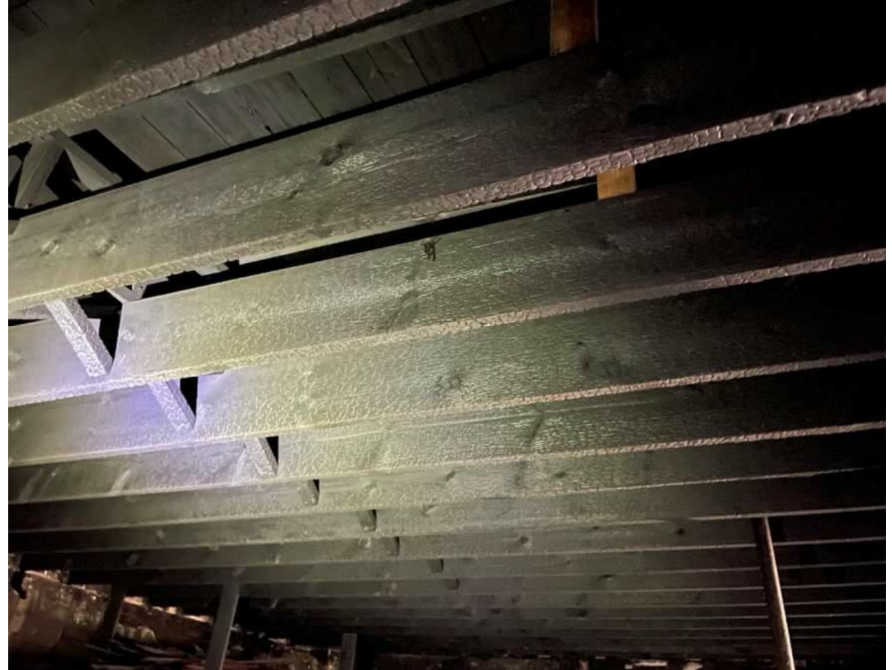
Photo 21: Existing roof joists that have been severely damaged due to fire.