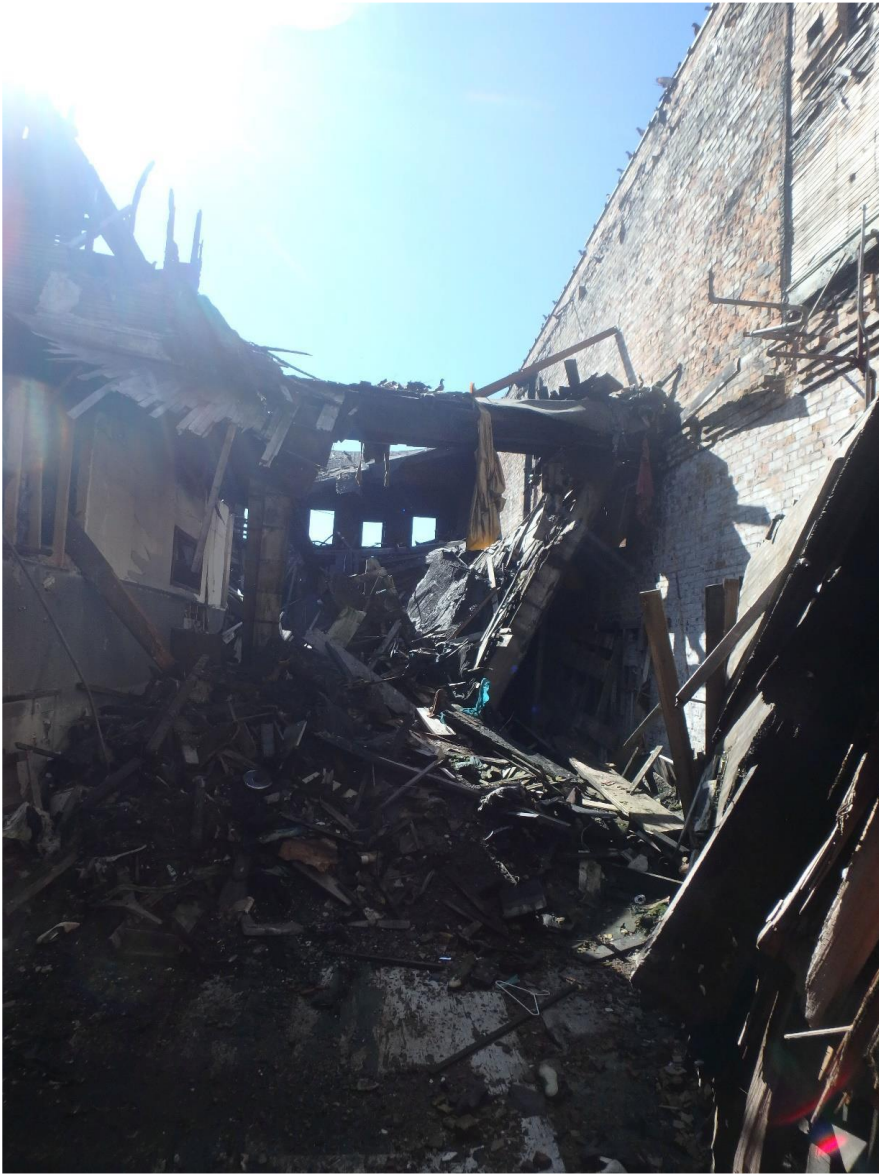
View of the caved in roof of the 118 East 1st Street building which resulted from fire damage to the building sustained around Thanksgiving 2020.