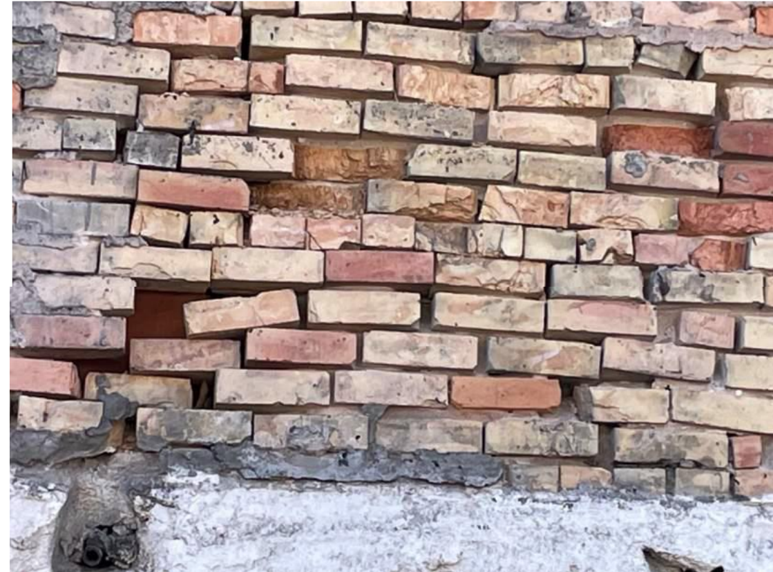
Photo 12: Close-up view of existing east exterior wall masonry condition