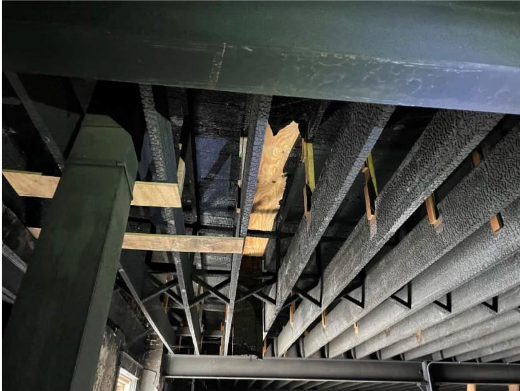
Photo 22: Existing roof joist framing severely damaged due to fire.