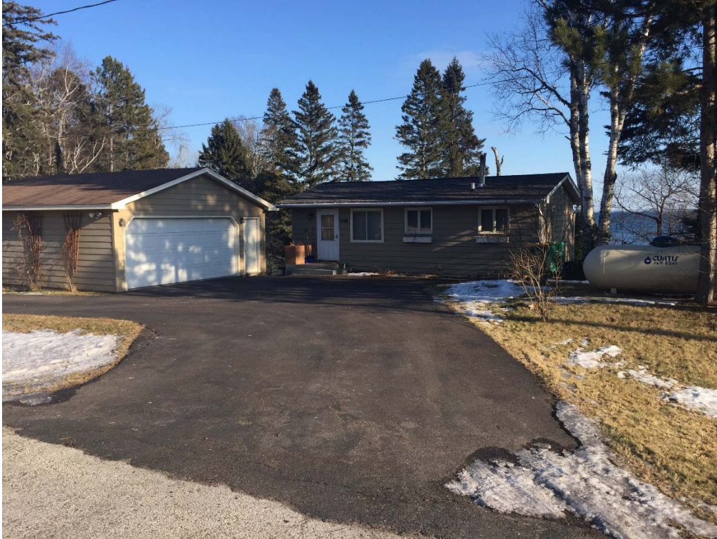
Front of the home