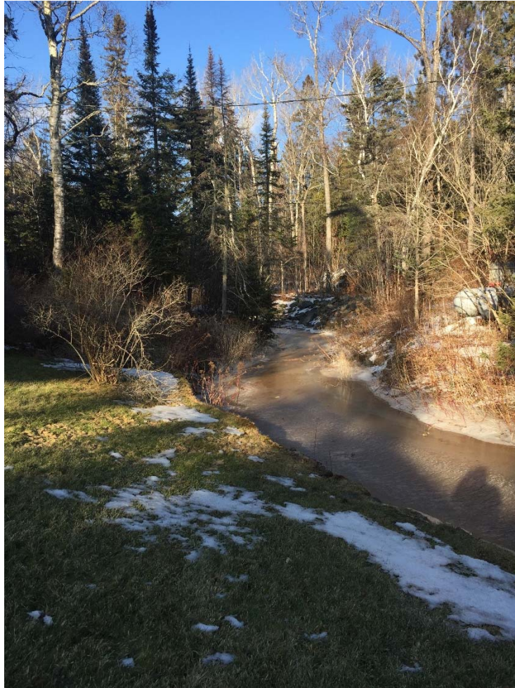
Creek view from the side of the lot

DEPARTMENT OF PLANNING & CONSTRUCTION SERVICES Community Planning Division 411 West First Street – Room 208 - Duluth, Minnesota 55802-1197 218-730-5580 – An Equal Opportunity Employer