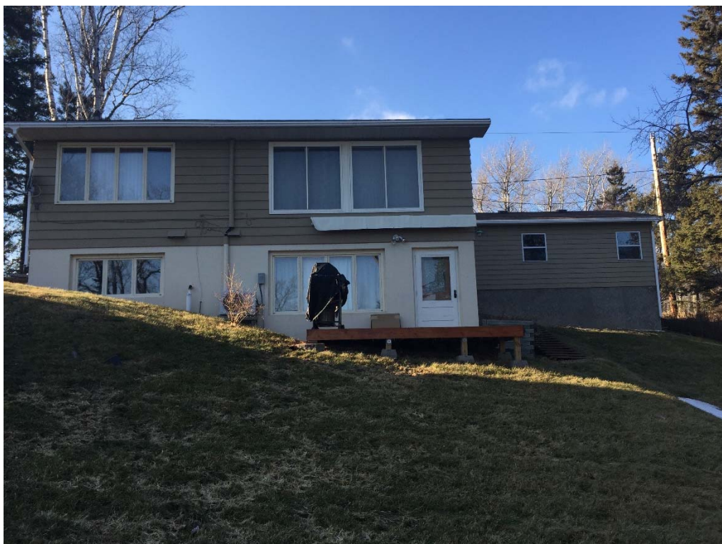
Back of the home and Entrance to Unit