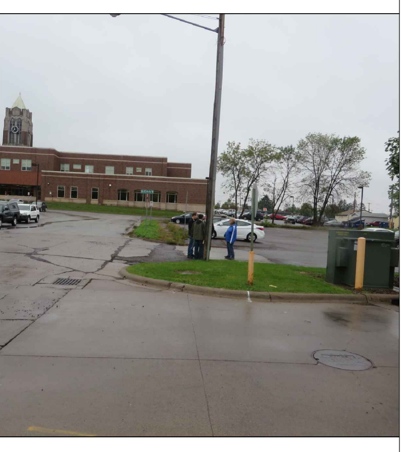
REPLACEMENT LIGHT POLE LOCATION