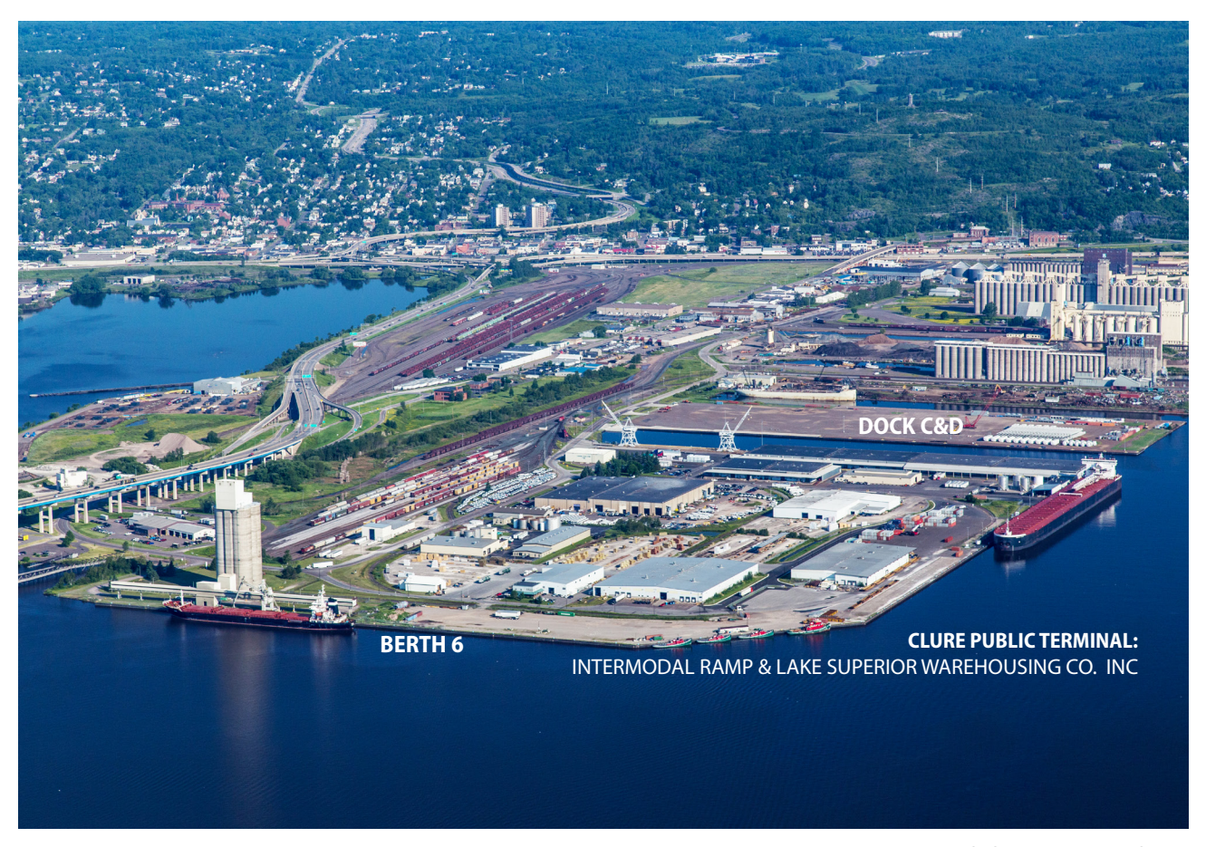
Figure 2: Duluth Seaway Port Authority

In 2016, the DSPA completed a reconstruction and expansion project of Dock C&D, a $17.7 million redevelopment project funded by a USDOT TIGER grant, grants from MnPDAP and MnDEED, and DSPA capital investment. This project provided additional maritime cargo handling and outdoor storage on Dock C&D, which allowed, for the first time in the Port's history, outdoor storage space to enable intermodal container handling capabilities on Berth 6 (see Figure 2). Adequate railroad and warehousing facilities were already in place on Berth 6. This allowed the port to quickly convert this space to an intermodal container terminal by merely constructing a check-in gate, extending the circulation and hauling access road to the intermodal terminal, and adapting existing warehouse space for Customs and Border Control purposes.