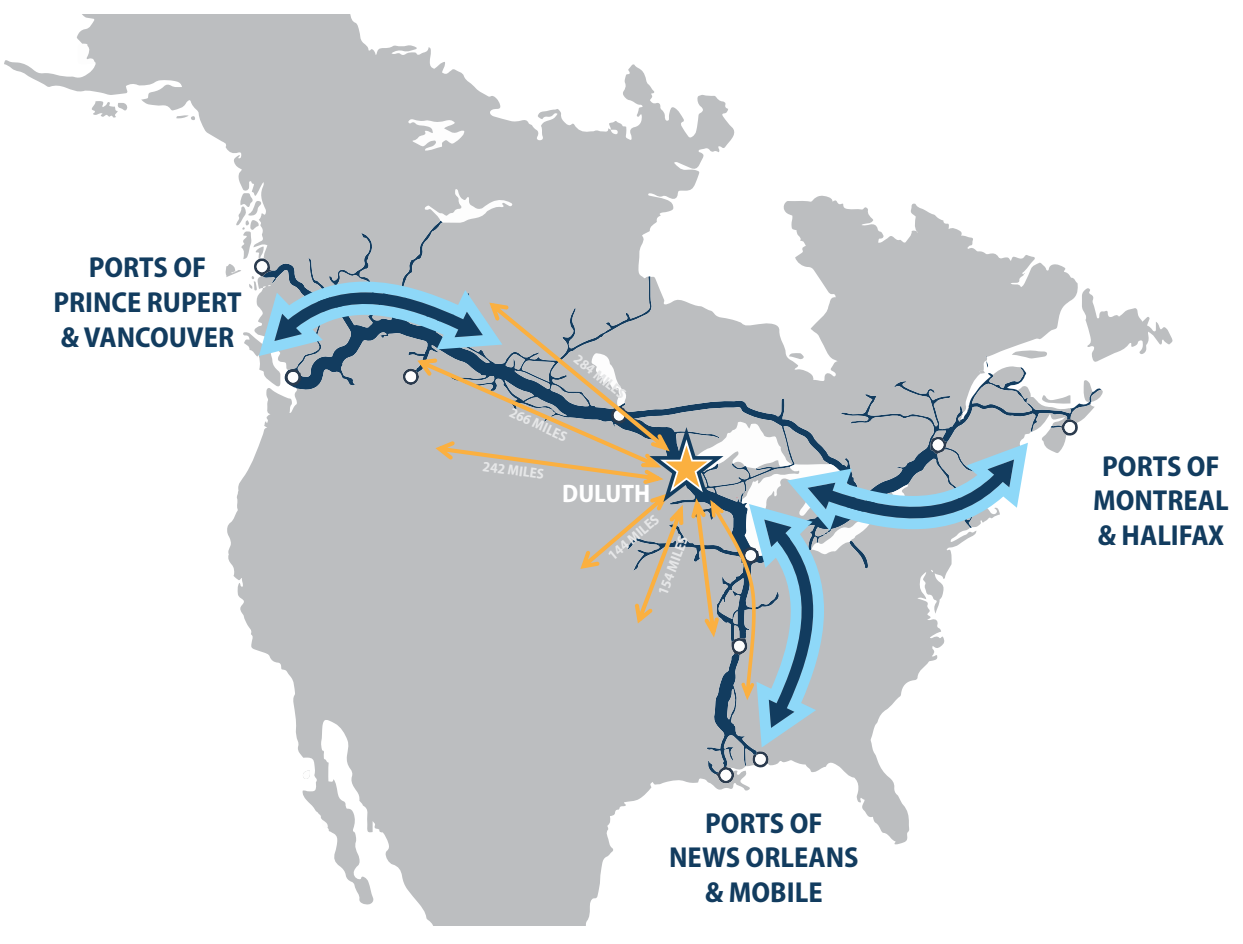
Figure 3: CN Railway's North American Intermodal Network

In March of this year (2017), Canadian National (CN) Railway, in partnership with the DSPA, officially opened the new "CN Duluth Intermodal Terminal" (DIT). The Terminal is located on the Clure Public Marine Terminal, Berth 6, and is directly served by CN Railway. The Twin Ports is located in the center of CN Railway's North American Intermodal Network that runs between Prince Rupert and Vancouver to the west; Chicago, Halifax, Nova Scotia, and Montreal to the east; and New Orleans and Mobile to the south (see Figure 3). CN is the only railroad in the Minnesota market that provides shippers with direct service to the East, West, and Gulf Coast ports.