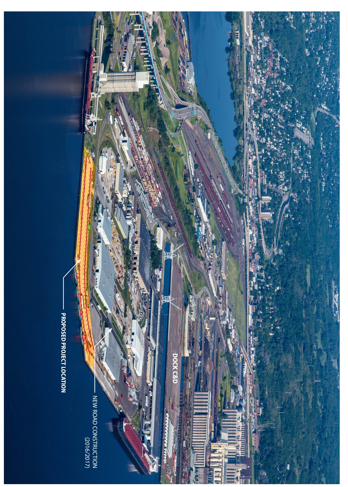
Figure 4B: Duluth Seaway Port Authority Intermodal Container Terminal Expansion Project Location